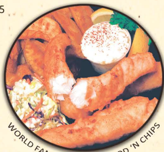
WORLD FAMOUS ALASKAN COD 'N CHIPS